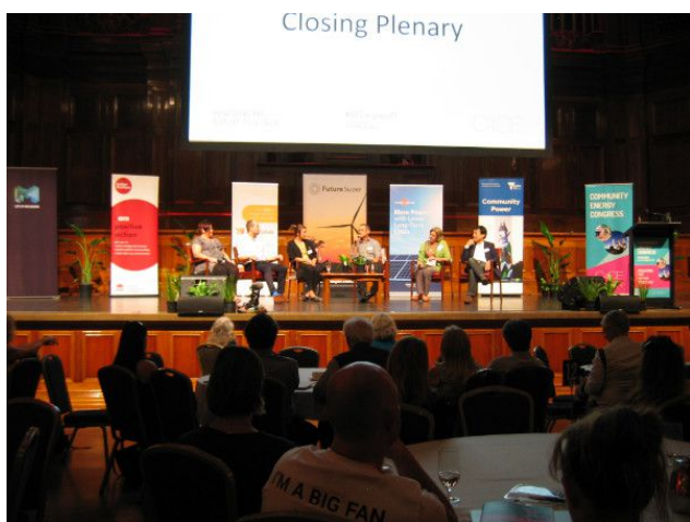
Closing Plenary discussion in progress in Melbourne Town Hall auditorium