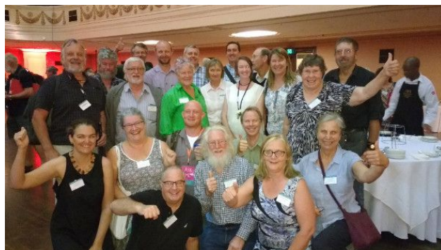
A group of participants, mostly from Gippsland, at the congress.

This event was noteworthy not only because of what was learned, but also because the deadline for filing our application under the NEJF (New Energy Jobs Fund) for the project at the State Coal Mine, Wonthaggi was the day after the Congress closed. The mandatory electronic filing deadline was met with only hours to spare - despite heroic efforts to do this prior to the Congress. Of course we now know this was well worth the effort!